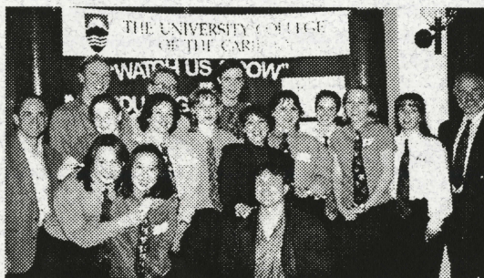
Event organizers and their faculty sponsors.

For more information, please contact Chinnama Baines at 250-828-5410 or Les Peters at 250-376-6900 (Cottonwood Campus).