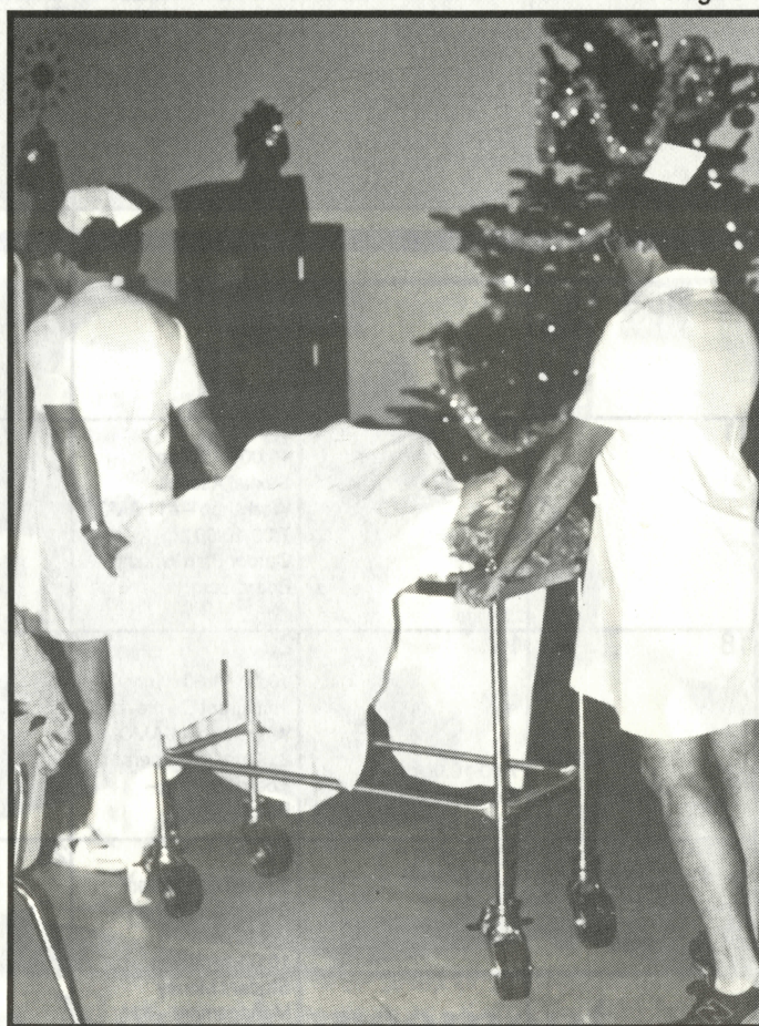
Wasn't that a party...?

The College will be hosting a one-day Red Cross Blood Donor Clinic in the Student Lounge on Wednesday, February 11, 1987 from 11:00 am to 5:00 pm. The Student Services Division has issued a challenge to all staff to find out which division can be the winner in this very worthwhile cause. Come on you health programs people, take up the challenge!