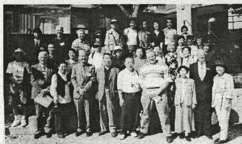
Uji delegation poses with UCC representatives outside the Campus Activity Centre.