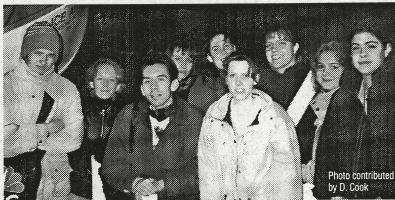
UCC Model UN Team on the Staten Island ferry.