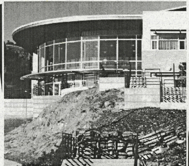
UCC's Trades and Technology Building is open and ready for business!