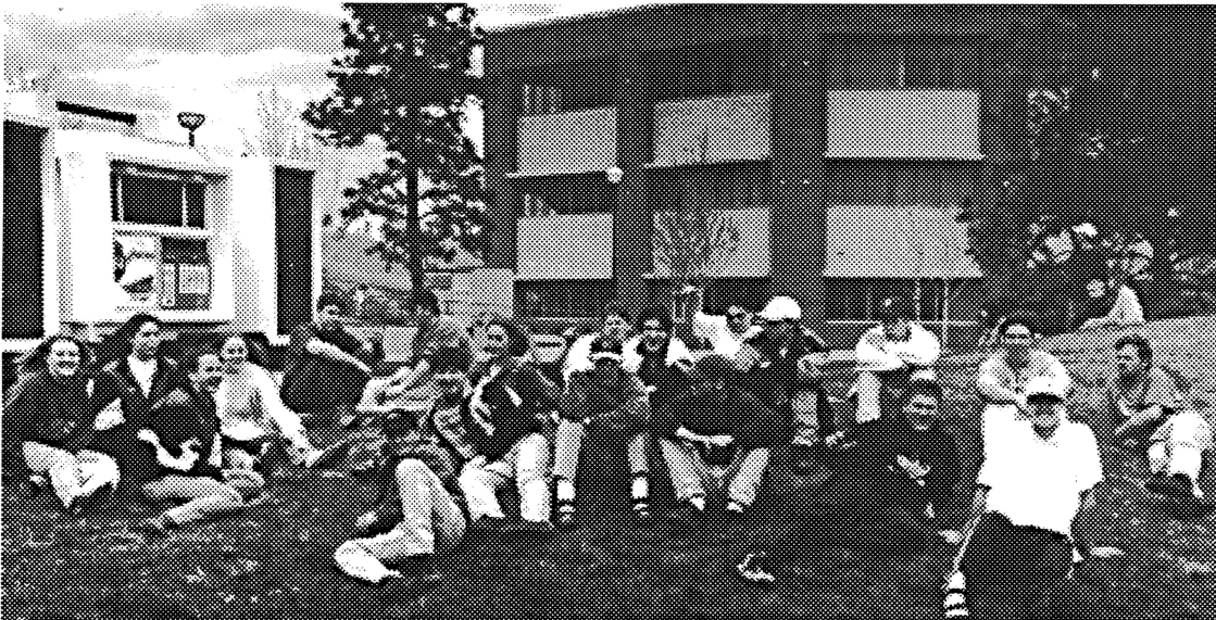
Students relax near the Rock Box at Career Fair. Campus-wide efforts by staff, faculty and administration made the day a success. Mother Nature helped too!

UCC Williams Lake offered the first Closer to Home Apprenticeship Program to be offered in BC. Presented in concert with School District #27, the program ran from February 12 to March 22, offering Level II carpentry training, and provided for the participation of both apprentices and secondary school students.