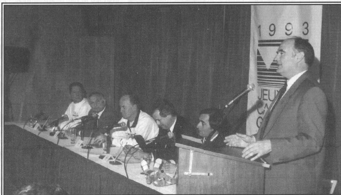
Representatives from all three levels of government and the Canada Games gathered at the Coast Canadian Inn recently to officially sign the multi-party agreement.

The signing ceremony included presentations by two students from Lloyd George School in Kamloops to the Honourable Pierre Cadieux, Federal Minister of State for Youth, Fitness and Amateur Sport and to the Honourable Robin Blencoe, Minister of Municipal Affairs, Rec-