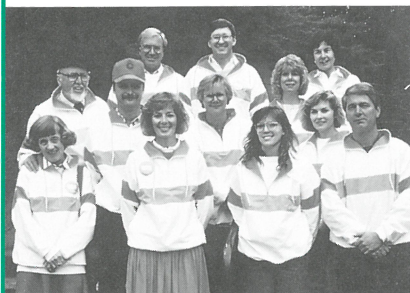
Photo: First Board of Directors for the Alumni Association at Homecoming '90 celebrations.

In 1989 Cariboo College underwent a dramatic change with the introduction of degree granting programs and the concurrent renaming of the institution to the University College of the Cariboo. New programs, new degrees, new buildings on an expanding campus; all significant parts to a growing, maturing institution.