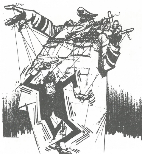
"The pro-freeze movement is being manipulated!"

The following article and cartoon, reprinted here from the November, 1982 issue of SANE WORLD, newsletter of the Washington, D.C. based peace organization SANE, points out just how divisive and harmful such attacks can be...and what the response to these ludicrous allegations should be.