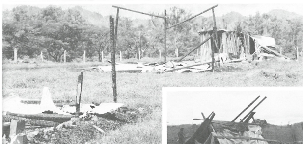
An estimated 250,000 Nicaraguans have had to flee their homes to avoid contra attacks.