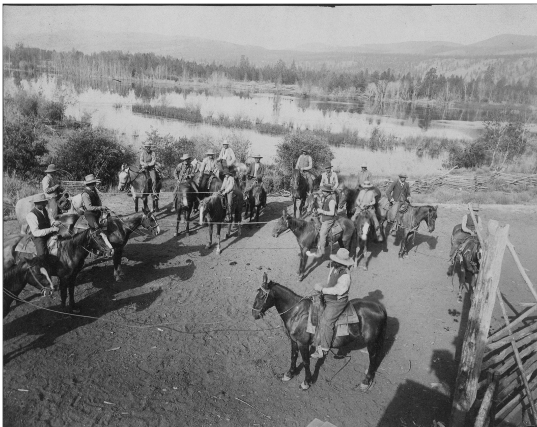
Cowboys assembled at the Edwards Ranch, North Thompson. Image 1196

It was not only the transient railway workers who sought drinking as their main social activity. Cowboys from local ranches took any opportunity to visit the saloons. On one night in May 1906 four ranch hands were sent to town to round up a herd of stray cattle near town and instead went straight to the Montreal Hotel and got drunk on $30.00