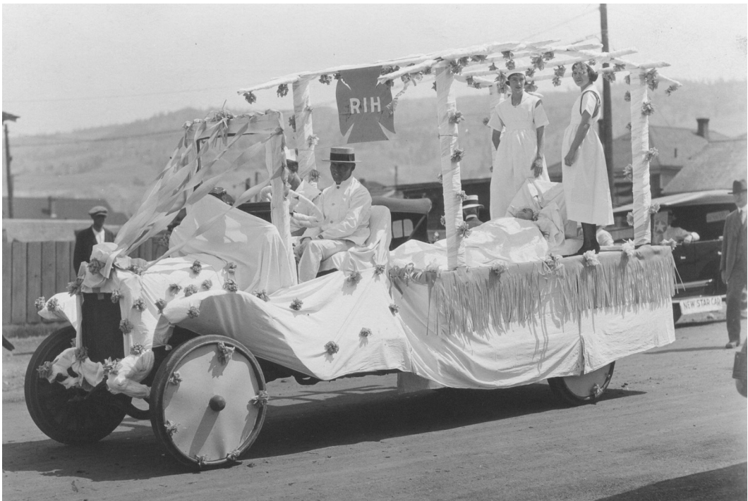
Royal Inland Hospital Float at Dominion Day Parade, 1924. Image 438 courtesy of Kamloops Museum and Archives

During the interwar era the Auxiliary continued to raise funds by holding dances, annual linen showers, tag days, bridge parties, teas, and concerts that not only successfully supplied the hospital with needed equipment and supplies but provided the community with much needed social functions and cultural activities. These activities not only made money for the hospital but also contributed to a sense of community. Its major project in 1920 was to supply the new hospital laundry with equipment. Fund-raising continued with 1927 being a banner year that led to the completion and furnishing of a nurses' home and additional beds being added to relieve the congestion in the hospital. In her report for 1927, the president Mrs. Annie Wyllie observed the "development and general progress all along the line." 111 Each year, however, it became more difficult to find sufficient funds to meet the hospital's ever increasing need for up-to-date equipment. The president recognized this problem and remarked that the Auxiliary would do its best until the city fulfilled its responsibility and adopted a "community chest method for carrying on its social welfare work." 112 This tactic was successfully put into place by the