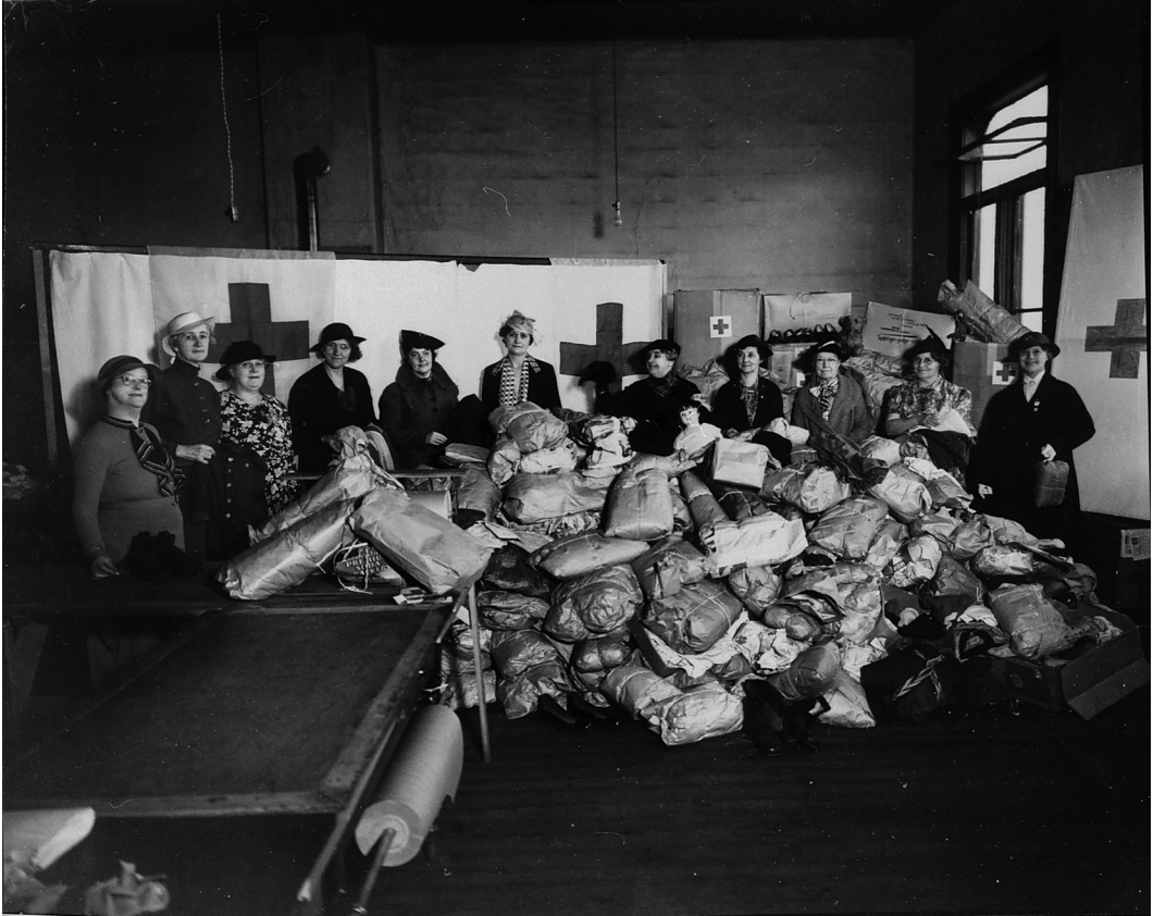
Red Cross sending parcels overseas during World War II. Image 8174 courtesy of Kamloops Museum and Archives

now not only included Kamloops, North Kamloops, and Tranquille, but extended north to Albreda, south to Stump Lake, west to Savona, east to Magna Bay into the Okanagan to Falkland and into the Cariboo to Alexis Creek. 304