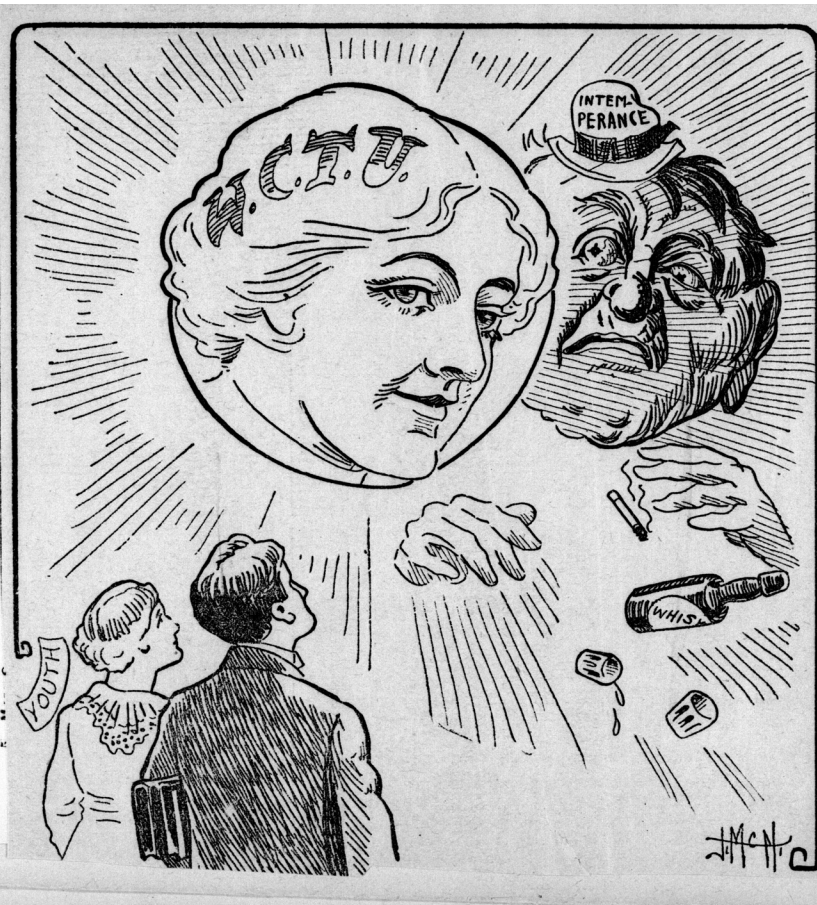
Nellie McClung and the Woman's Christian Temperance Union