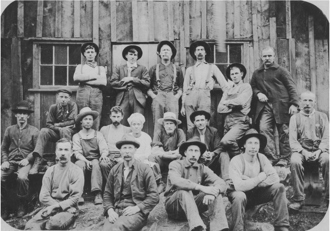
Resource industries created Gender Imbalance. Early logging crew. Image 1204

constraining customs or, if they felt it necessary, defend themselves by staying within the social barriers constructed by a patriarchal society. By 1921 the gender balance began to shift throughout the province and was reflected in Kamloops with 2,436 males and 2,065 females being recorded in the census. 46