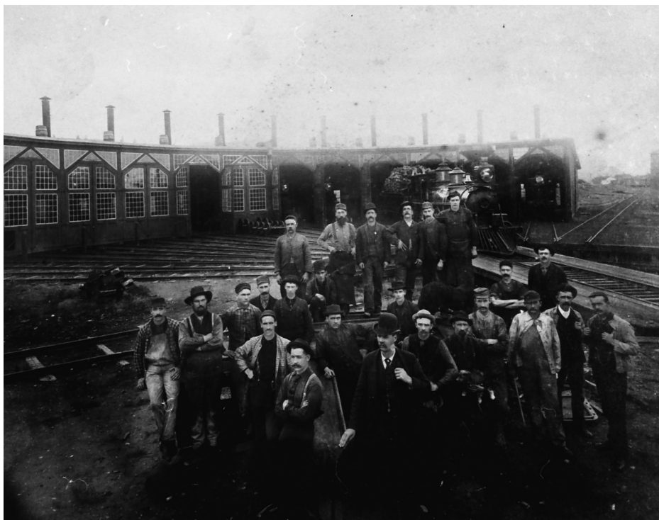
Canadian Pacific Railway workers at the Kamloops Roundhouse, 1891. Image 91 courtesy of Kamloops Museum and Archives

Emigration Society, the Colonial Intelligence League, and British Women's Emigration Association continued to bring women to the west. This process solidified the links between Empire, white women, race and respectability and women became contributors to the "construction and maintenance of white superiority." 42 In the Kamloops region,