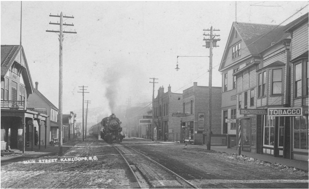
Main (later Victoria) Street West during the days prior to 1914 when the C.P.R. operated trains through the middle of the original business thoroughfare of the city. "The longest streetcar system in the world." Image 1625 courtesy of Kamloops Museum and Archives

realized that a new hospital was a necessity and acquired the Columbia Street property in 1910 and began construction soon after. The citizens of the community willingly passed a city by-law in support of the new hospital. Its completion in 1912 was a year for celebration as it was also the centenary of the Fort Kamloops trading post. Recognizing the importance of the hospital to the community, the city had it officially opened by the Duke of Connaught, the Governor-General. The new hospital was a large three story Victorian style brick building with 128 beds. The larger facility was a definite progressive step for the community but it also required more financial support. 84