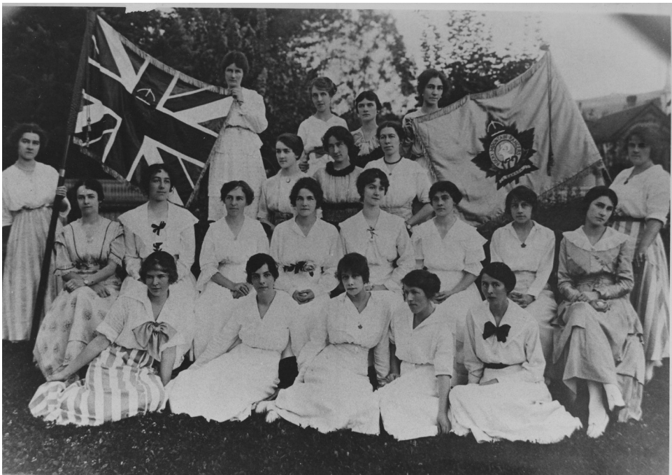
Red Cross Guild presenting the colours to the 172nd Rocky Mountain Rangers Battalion just prior to the departure overseas in World War I.