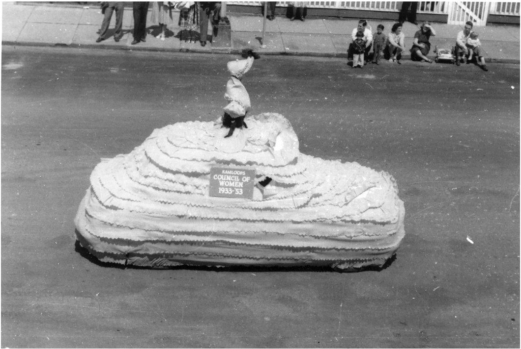
Kamloops Council of Women in the Kamloops Diamond Jubilee parade, 1953.