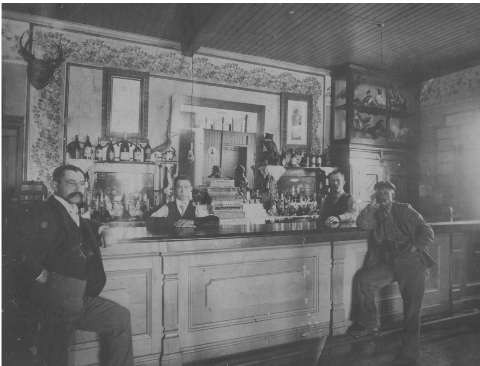
Drinking and Male Culture Bar of Montreal Hotel, Kamloops, 1905 Image 4363

large quantities of alcohol and considered it a healthy drink that was often more readily available than tea, coffee, and clean water. It was a province wide phenomenon and residents of B.C. surpassed their eastern Canadian counterparts by consuming one and a half times as much liquor. Seasonal unemployment in the lumber and other resource industries only added to the problem and increased the tendency to drink. 143