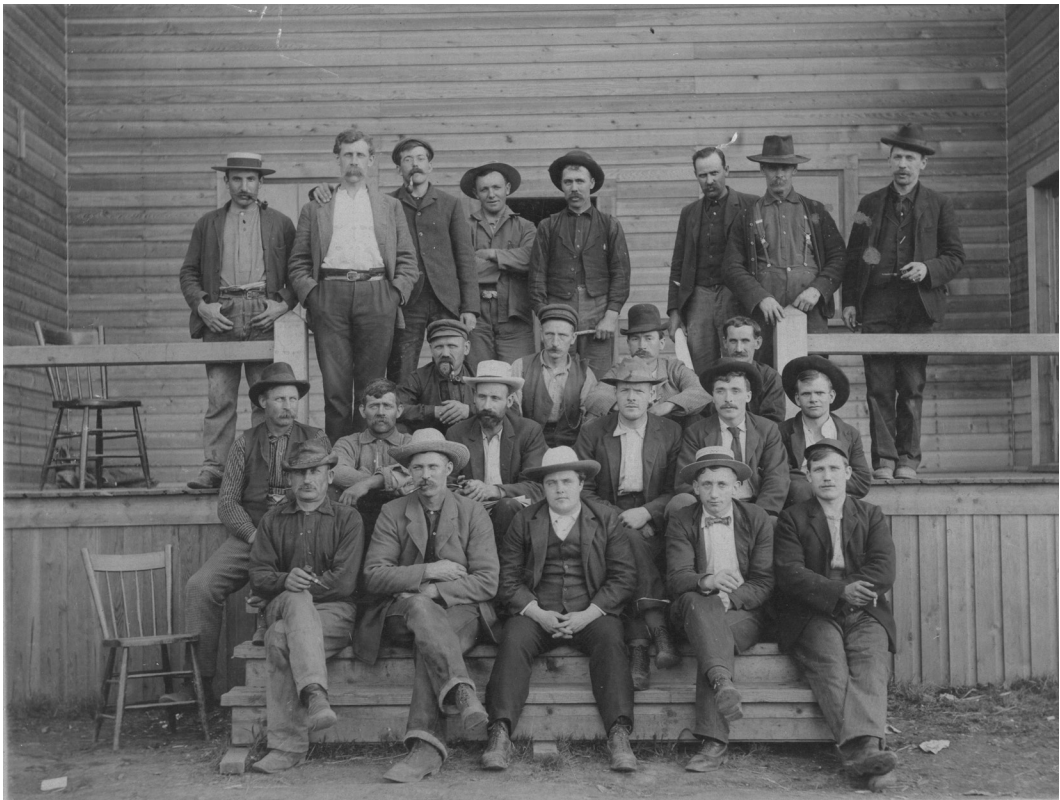
Crew from Iron Mask Mine outside their boarding house. Image 1143 courtesy of Kamloops Museum and Archives

Despite this infusion of Anglo-Canadian culture, the frontier nature of