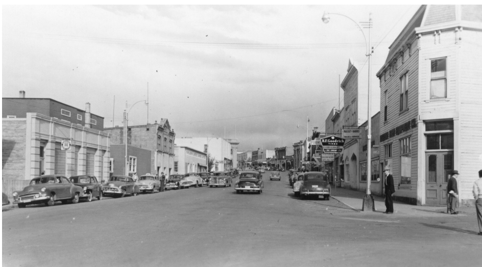
Kamloops in the 1950s. Victoria Street looking East from First Street, Bank of B. C., 1952.