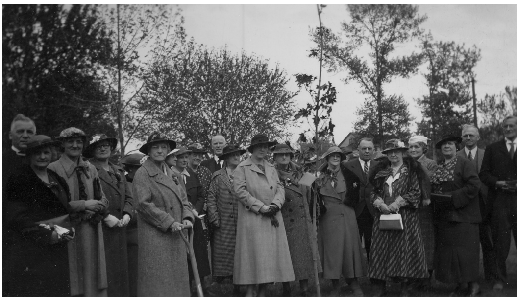
Kamloops Council of Women planting a maple tree in Riverside Park.