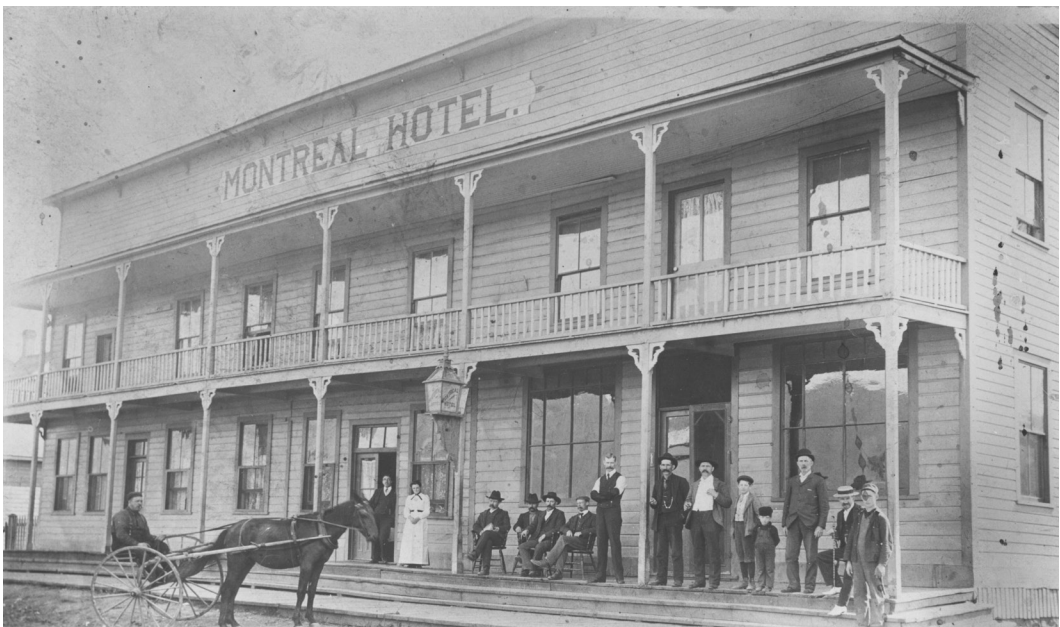
Montreal Hotel with patrons outside the bar in early 1900s.