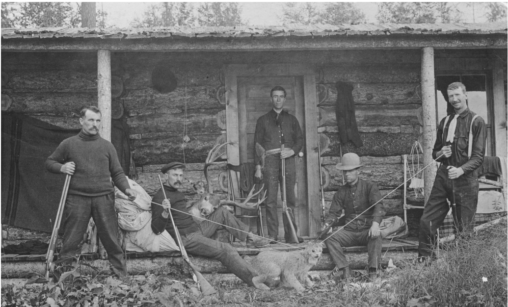
Frontier Male Culture personified by photo entitled, "Big Game Hunters."