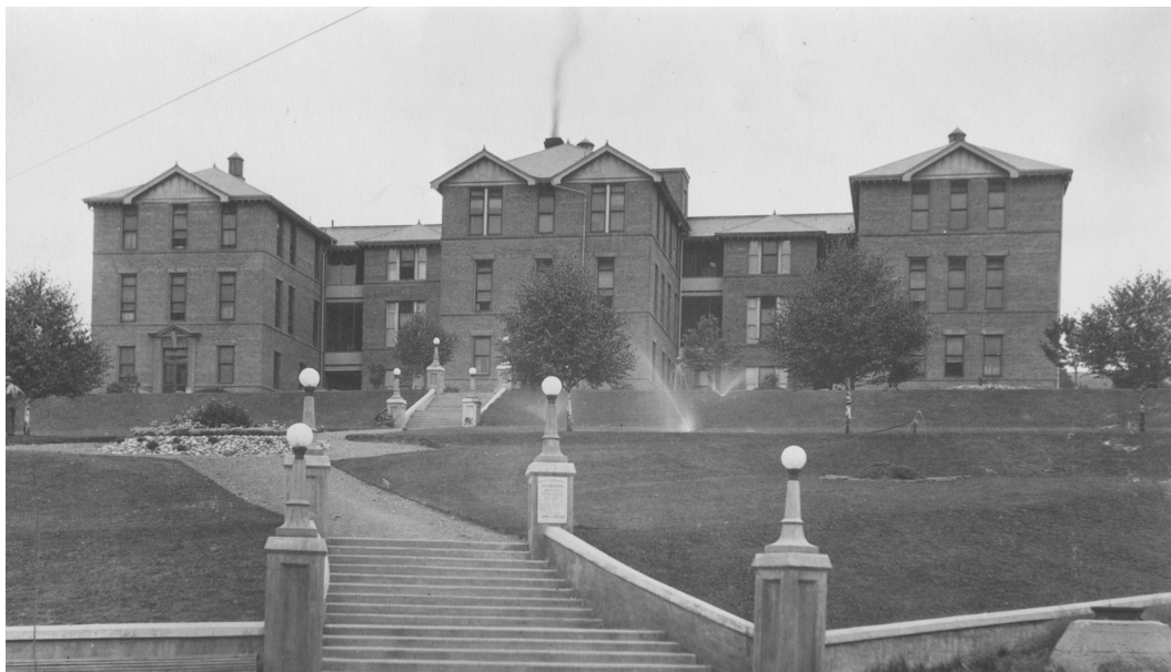
Royal Inland Hospital, 1921. First opened in 1912. Image 1892 courtesy of Kamloops Museum and Archives

became ill and it proved impossible to find nurses from other communities who were also under pressure to cope the Kamloops Standard Sentinel placed an emotional appeal for any retired nurses to come to the hospital's assistance in these extraordinary circumstances.