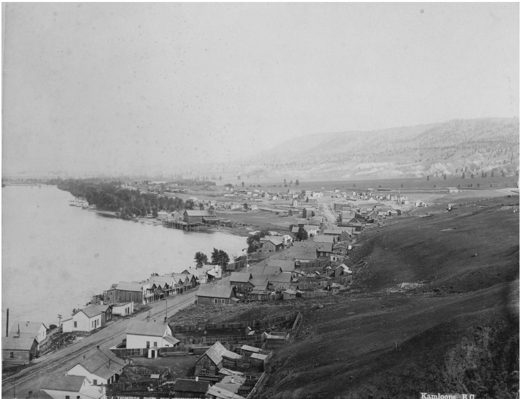
Kamloops, 1891, as seen from West End hillside. Image 5850

and require independent analysis to understand their uniqueness and difference to other associations. Some like the Ladies' Auxiliary to the Royal Inland Hospital, (LARIH) had an elite membership but at the same time were fiercely independent and determined to help resolve the health issues that were more problematic than in other parts of the province due to the growth of the town and expansion of the population in the large region the hospital served. Another example is the Red Cross Guild's restriction of membership to single women that made it exceptional to the norm. These young women fulfilled