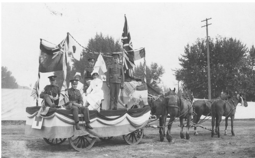
Red Cross Guild appeals for support in World War I by entering a float in a parade in September, 1915. Image 418

The activities of the Red Cross discussed in chapter four confirm women's key role in building the Kamloops' infrastructure, particularly in the area of health. The formation of the Red Cross Guild by single young women contradicts the stereotypical views of women's associations being organized by middle class married women and illustrates the diverse nature of these organizations. Despite its evolution to middle class women's leadership and then to mixed gender membership, women remained the driving force and initiators of post-World War I plans to build a better community. Establishing one of the province's first and most successful Well Baby Clinics, a public nurse and other health services, the Red Cross provided social action at a grassroots level. While the separate spheres ideology still kept politics predominately a male preserve the women of Kamloops did not wait for provincial or civic legislation but instead sought to resolve social problems in the community. As the primary co-ordinator of assistance to the poor